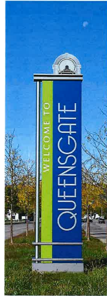
Welcoming Gateway Signage