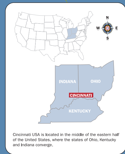
Cincinnati USA is located in the middle of the eastern half of the United States, where the states of Ohio, Kentucky and Indiana converge.

The Japanese Language School of Greater Cincinnati was established in 1975 by a small group of parents who wanted their children to learn Japanese. Today, the school is housed on the campus of Northern Kentucky University and is one of the largest of its kind in the Midwest, with approximately 400 students enrolled.