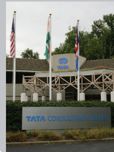
Tata Consultancy Services located their North American service delivery center in Clermont County, one of 15 counties in the Cincinnati USA area, in 2008.

■ Fostering a personal network among IT executives with Fortune 500 level companies doing business here, the Cincinnati USA CIO Roundtable provides a forum for the exchange and discussion of ideas on topics of mutual interest. This group has demonstrated their commitment to the region's IT ecosystem through action and investment in groups such as the Annual CIO Symposium, INTERalliance, University Advisory Boards and more. There are also similar CIO Roundtable groups for IT leaders of small- and mid-tier companies.