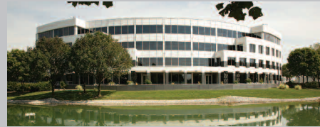
Vora Technology Park is home to Vora Ventures, one of the largest Indian-owned IT Private Equity groups in the US.

■ Several top global consulting firms, including Sogeti/Cap Gemini, Tata Consultancy Services, Accenture and Atos/Origin, have located major North American offices in the region.