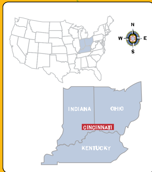
Cincinnati USA is located in the middle of the eastern half of the United States, where the states of Ohio, Kentucky and Indiana converge.